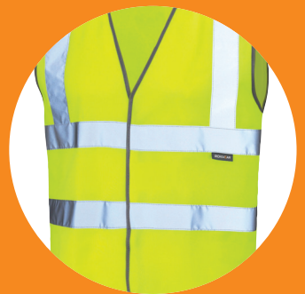
Double bands and braces