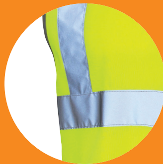
Sewn on tape